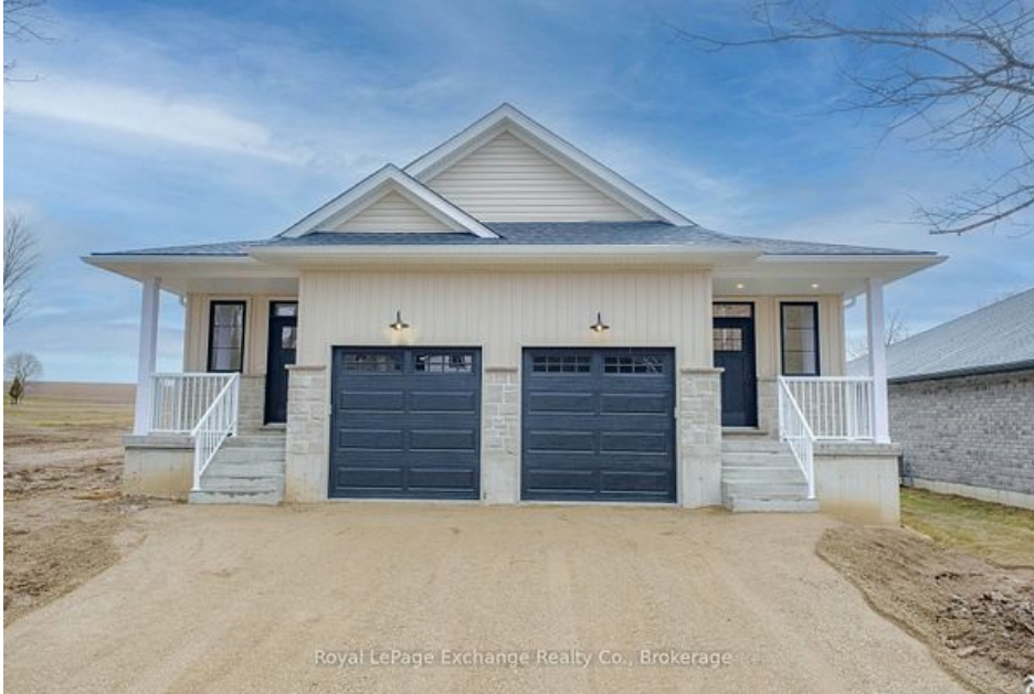
Royal LePage Exchange Realty Co., Brokerage