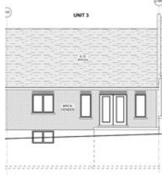
Back of Structure