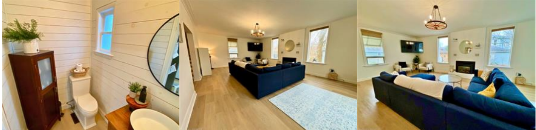
Bathroom Living Room Living Room