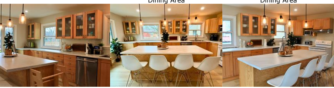
Kitchen Kitchen Kitchen